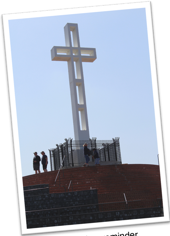
A somber reminder