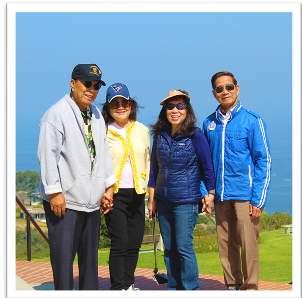
Old Comrades enjoy the View