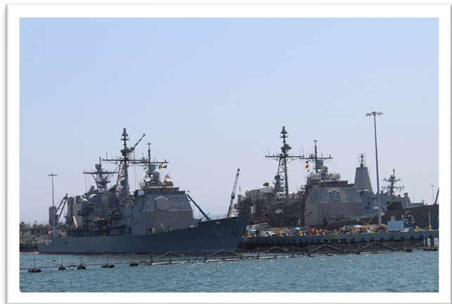
Destroyers at the Naval Base