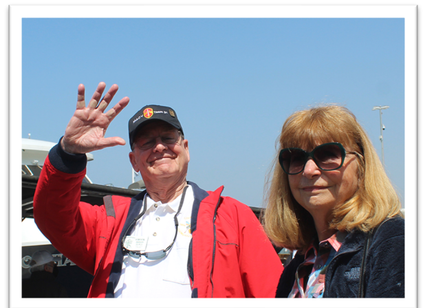
Team 31 Strikes Again!