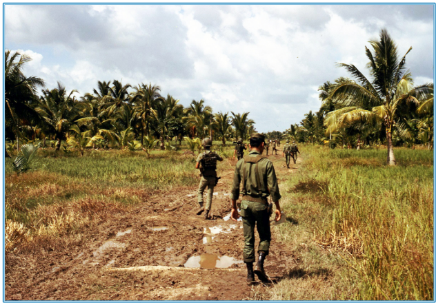
The district chief is directly in front of me. Within minutes of taking this picture, a soldier on our right flank hit a booby trap and was carried to this road

Perhaps the most important event that cemented our relationship occurred just a short time later, on a large operation in the dangerous western part of the district. It was the first time I had gone on to the field with this district